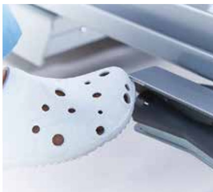
Variable height foot switch