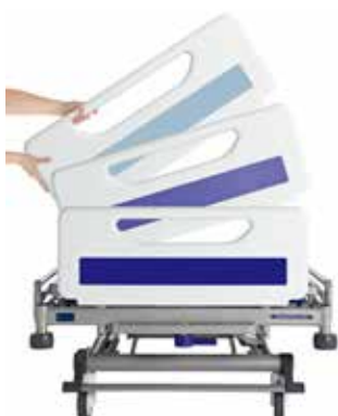
Panel colour options