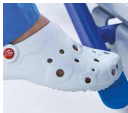
Non powered 5 th wheel