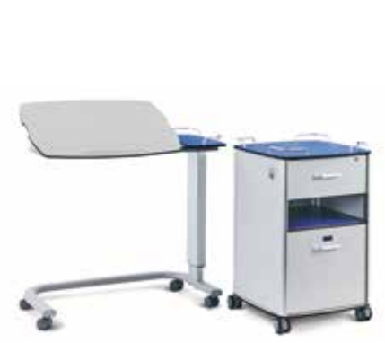
Bed side furniture