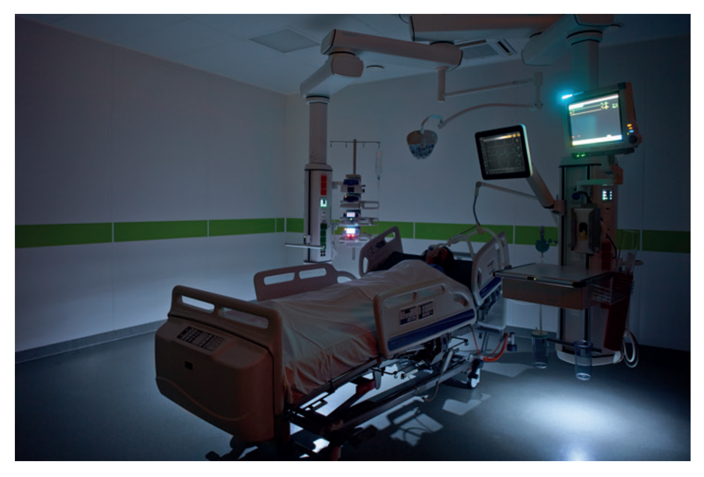
Ambient lighting: better environment, better patient experience.

In neonatal intensive care units (NICU), MODUEVO ensures key technologies and equipment are readily accessible as skilled staff treat the hospital's newest and tiniest patients. Infants taken to the NICU are often born premature, or have other high-risk factors – and require rapid attention and specialized care. In the NICU, MODUEVO's fixed column allows neonatologists and other medical professionals to quickly and flexibly add any device they need.